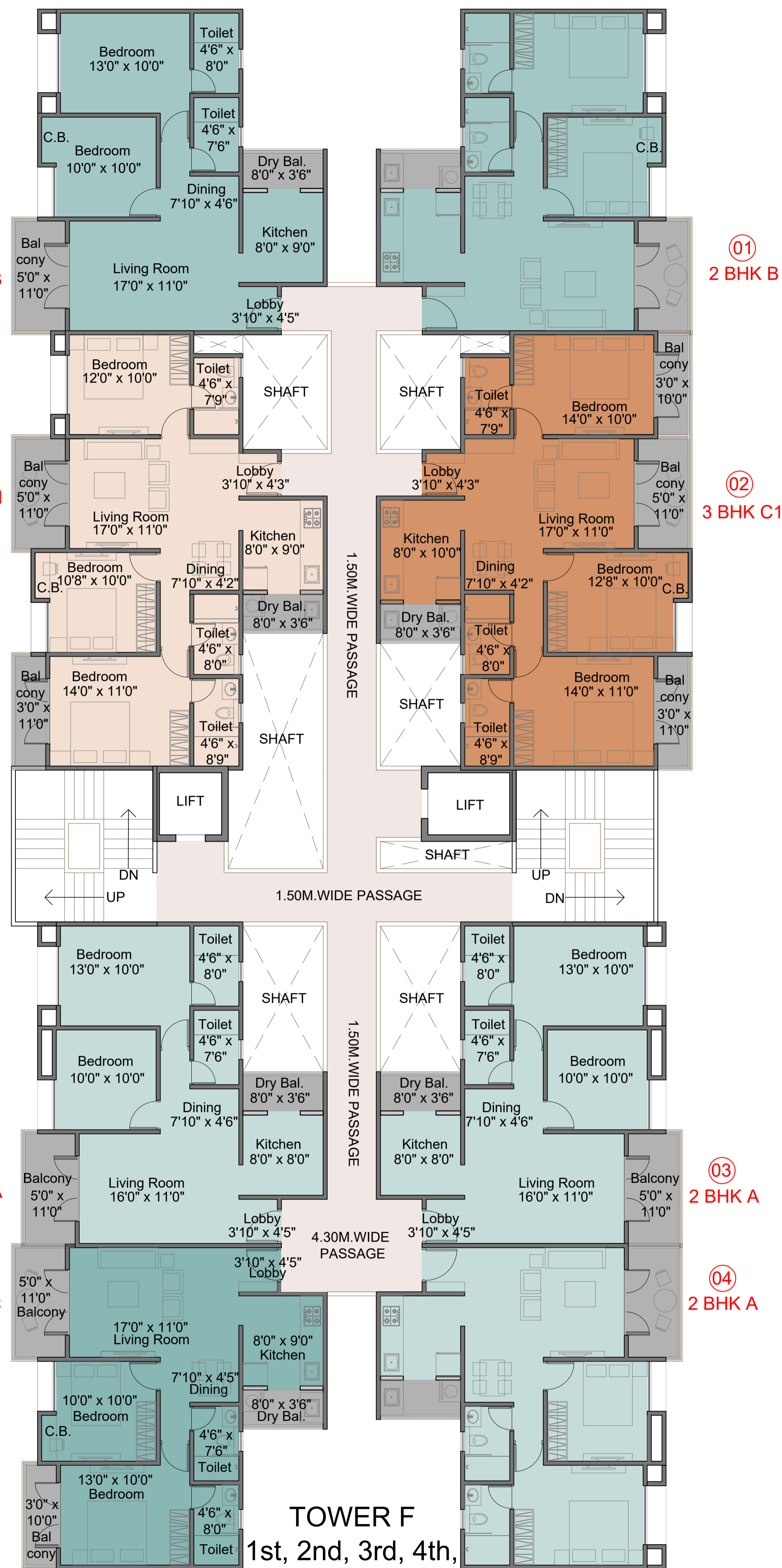
TOWER F 1st, 2nd, 3rd, 4th, 5th, 6th, 8th, 9th