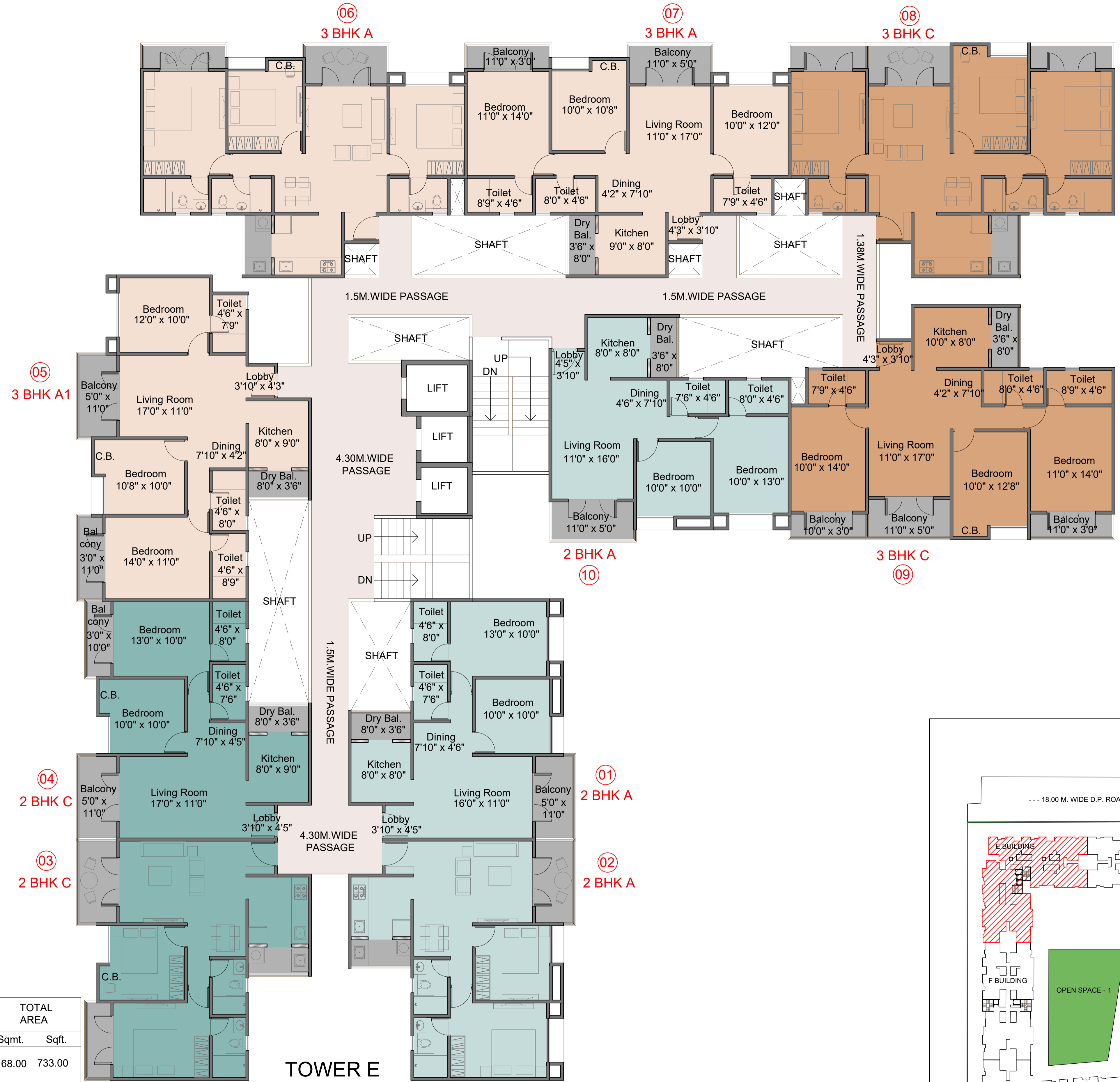
TOWER E 1st, 2nd, 3rd, 4th, 5th, 6th, 8th, 9th